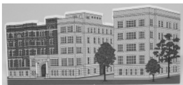
White Cross Hospital Carving

10" wide x 4 1/2" high x 1/2" thick Done in colors of brick red / yellow / gray