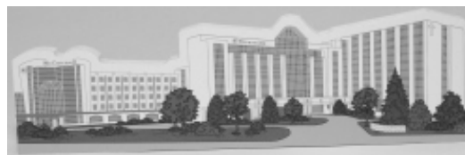
Riverside Methodist Hospital Carving

10" wide x 4 1/2" high x 1/2" thick Done in colors of brick red / yellow / gray